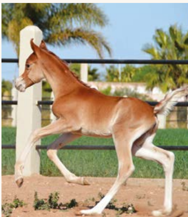
SHAHADA SHAQRAN by Exotic Sadiiq x Rajmala pc

"All our horses, mares, and stallions are carefully selected. Our focus is impeccable pedigree, exotic type, correct conformation and athletic movement. Our broodmares band is of primary importance and the foundation of the stud. In the pedigree, we pay special attention to the dam line because of its prepotent genetical character. Our different selected broodmares belong to different strains. All are represented in the stud: the Slaklawi Jedran strain through the farm and