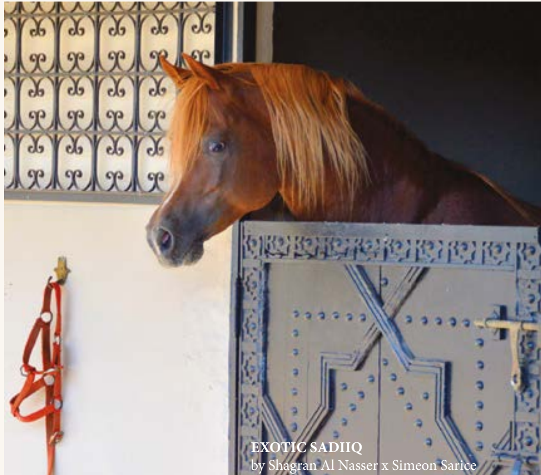
EXOTIC SADIQ by Shagran Al Nasser x Simeon Sarice