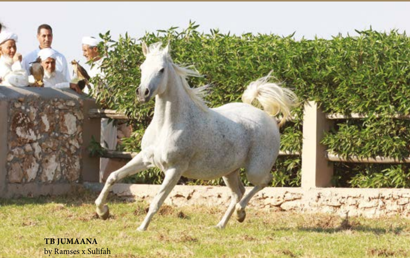
TB JUMAANA by Ramses x Sulifah