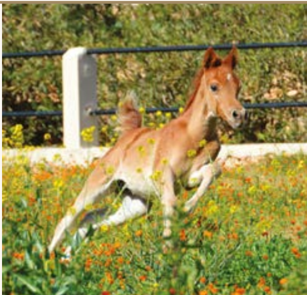
SHAHADA EL MAZI by Shahada Jumaan x Shahada Mumtaza