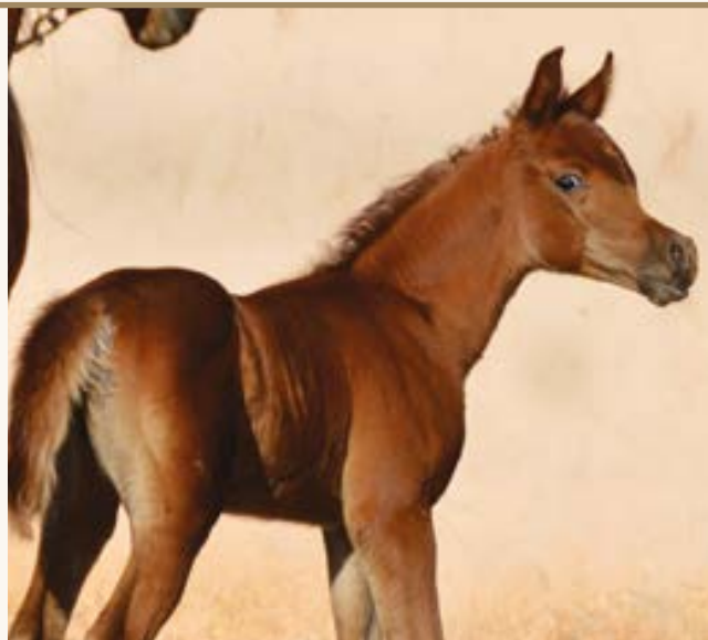
SHAHADA NARJIS by Ajmal Sahaab x Shahada Nejda