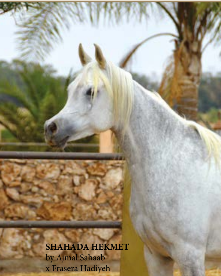
SHAHADA HEKMET by Ajmal Sahaab x Frasera Hadiyeh