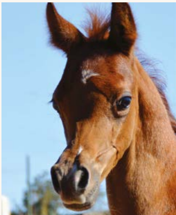
SHAHADA IBN SETH by Exotic Sadiiq x Shahada Sudara