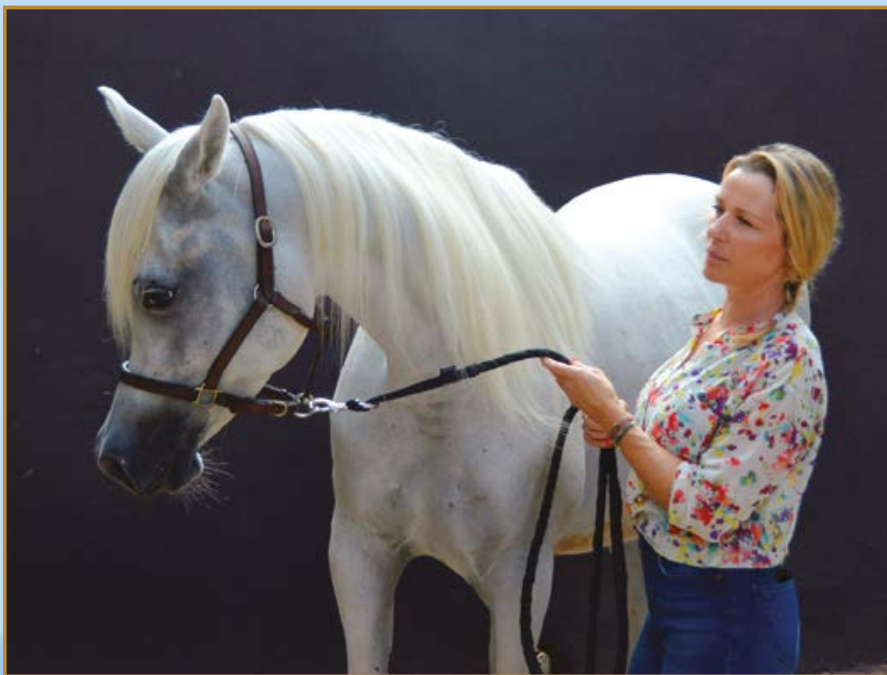
SHAHADA SEMIRAMIS by Ajmal Sahaab x Rajmala pc and Lise Laghzal

The beautifully landscaped premises are spacious and intelligently styled. In the southern part of the premises there is a cool, well-shaded inner yard with roomy box stalls for the stallions, surrounded by paddocks with run-in sheds. In the northern area, there are barns for the mares and foals, also with a well-shaded inner yard and surrounded by pastures and paddocks. Many of the horses are broken for riding and trained by the Laghzal couple themselves, with Youcef Laghzal being his own show handler.